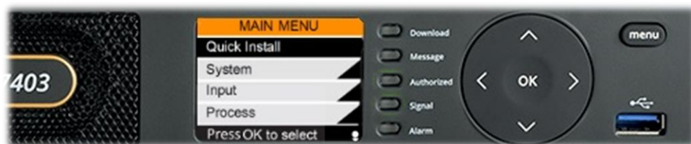
DSR-7400 HD SERIES Front Panel Control Buttons

When the unit has fully booted the main menu will appear.